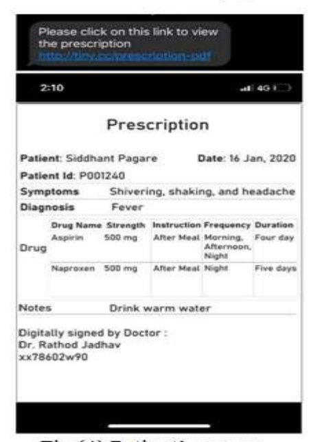
Fig (4) Patient's screen